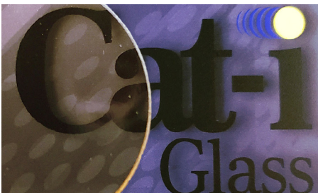
CAS 16.1S Yellow