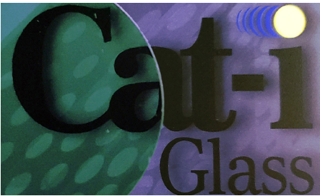
CAS 12.1S Light Green