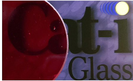
CAS 15.2S Ruby Red