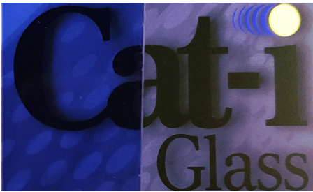
CAS 13.2S Light Blue