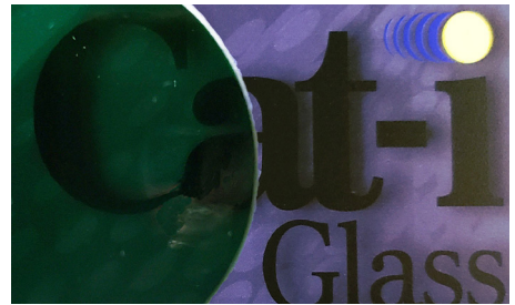
CAS 12.5S Dark Green