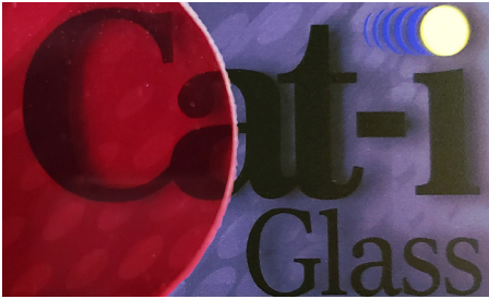
CAS 15.1S Cherry Red