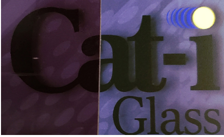
CAS 14.2S Light Purple