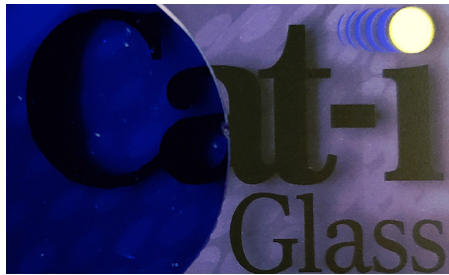
CAS 13.6 Dark Blue