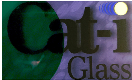
CAS 12.3S Medium Green