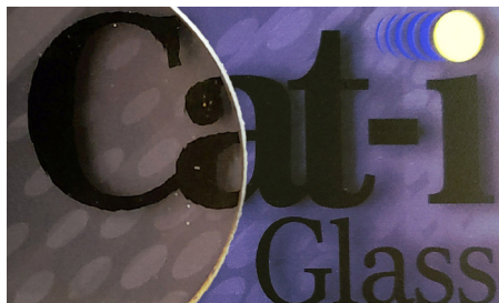
CAS 11.2S Light Amber