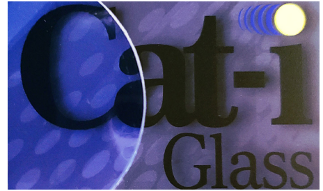
CAS 13.8R Pale Blue